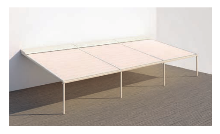
Coupled system: maximum of 3 bays at 4.5m in wide