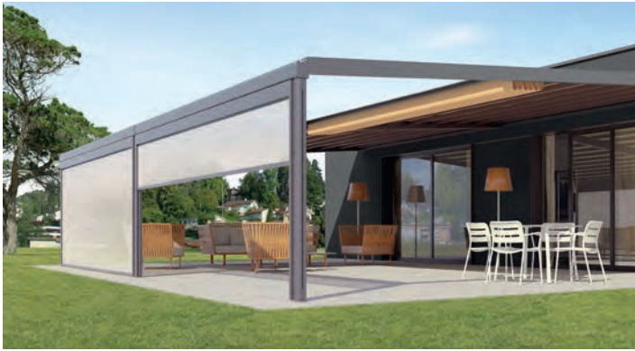
PERGOLA & PAVILLON